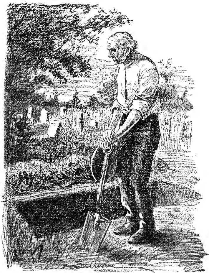
"The sexton leant on his spade"